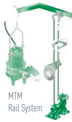
MTM Rail System