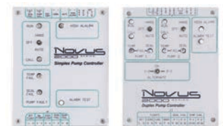
Novus 2000 Simplex Controller Unit

The Hydromatic Novus 2000, 3000 and 4000 Series offer more advanced features. These series use state-of-the-art digital controllers that are optimized for submersible pumps in simplex, duplex or triplex wastewater lift stations.