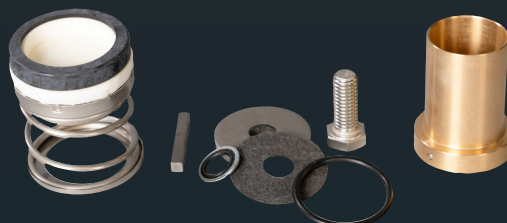
End Suction Repair Kit