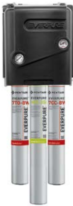
MRS-350CC-BL System: EV9973-65 (115 VAC/60 Hz)

CONFIGURABLE SYSTEM THAT DELIVERS REVERSE OSMOSIS OR BLENDED WATER FOR MULTIPLE FOODSERVICE APPLICATIONS